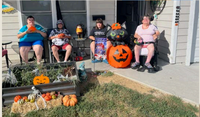
Pumpkin painting with the girls at 3612